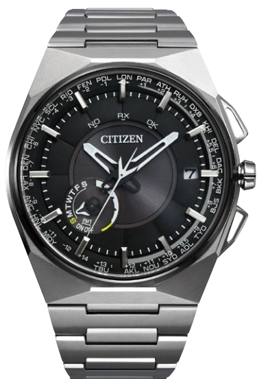
CC2006-53E Main Model