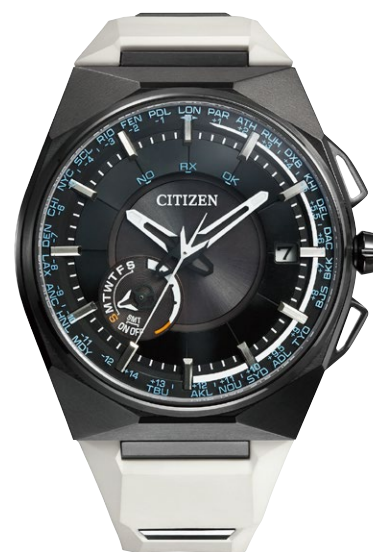
CC2004-08E 500 Pieces Worldwide